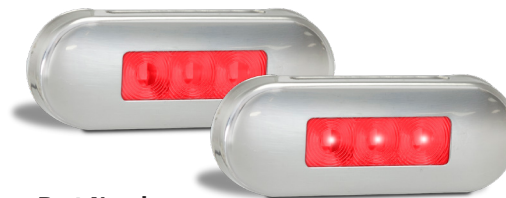
Part Number 86RRM - Blister Single 86RRMB - Bulk boxed