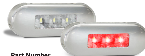
Part Number 86RM - Blister Single 86RMB - Bulk boxed