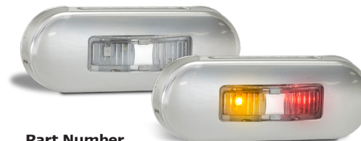
Part Number 86ARM - Blister Single 86ARMB - Bulk boxed