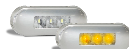
Part Number 86AM - Blister Single 86AMB - Bulk boxed