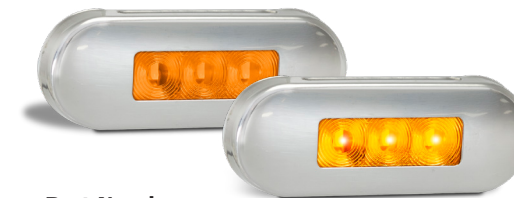
Part Number 86AAM - Blister Single 86AAMB - Bulk boxed