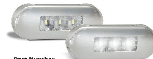
Part Number 86WM - Blister Single 86WMB - Bulk boxed